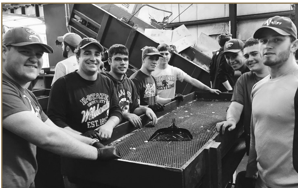
Gameday Recycling at the K-State Recycling Center

service performed this past semester alone, not to mention the nearly 1,400 hours of community service performed by brothers since January. We are all thankful for the opportunity to have been able to help better the Manhattan community as we are a part of it, and we are proud to further our education in such a wonderful place. Our motto is to make better men, and the Alpha Zeta Chapter continues to build men of the highest character through dedicated service to our brothers, school and community.