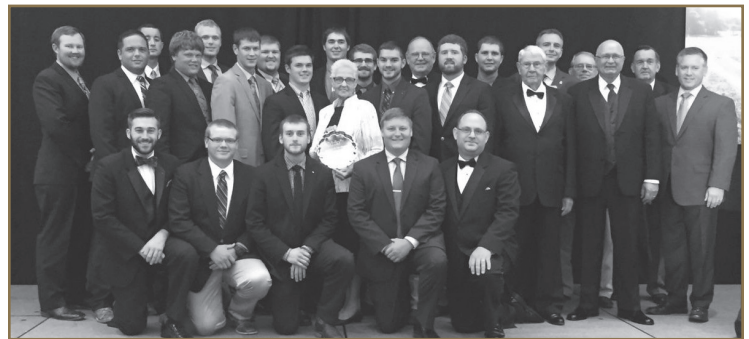
Alpha Zeta takes on Omaha