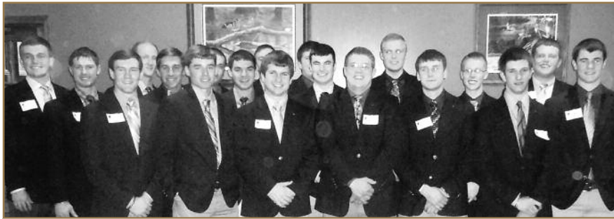
Undergraduate Scholarship Recipients

the success we are today. The goal is to encourage all alumni to consider joining us next March for another great evening with the Alpha Zeta membership. We might outgrow the Blue Hills Room, but if we do don't worry there are bigger places around.