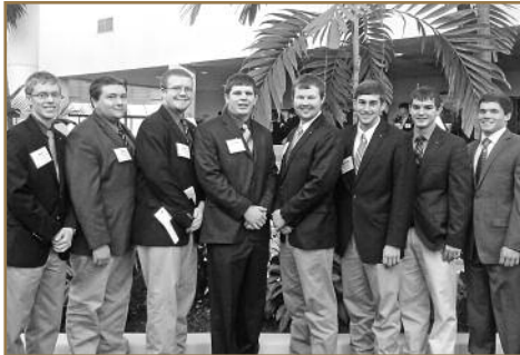
Executive Council Members before the Closing Ceremony

All nine of our executive officers left Manhattan for a weekend to spend time with other AGRs and Sigma Alphas from around the country to learn to be better leaders in their own chapters. This year's conference theme was "My Team, Our Dream." Playbooks and game plans were a large part of this year's convention. Our members worked together to set up goals for the chapter and plans of attack for their own respective offices.