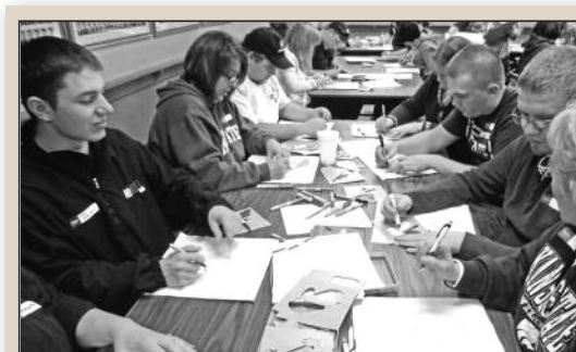
Alpha Zeta Chapter held their Moms' Day