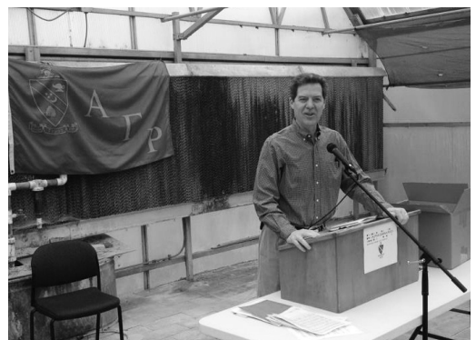
Governor Brownback speaking at Blueville Nursery.