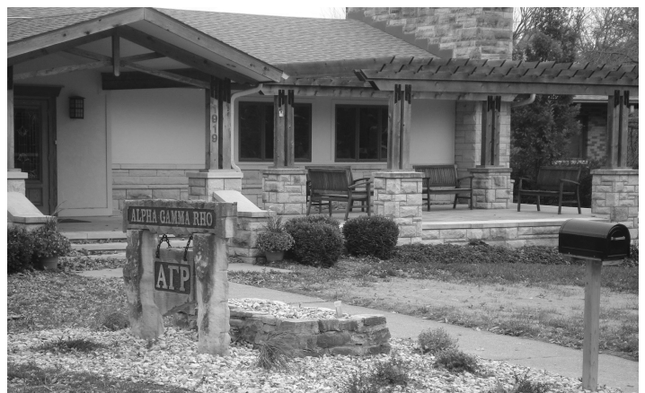
The undergrads chipped in $10,000 for priority improvements.

"These improvements would not be possible without the campaign," added Roger. "The undergraduates' rent just pays on our note and normal maintenance. There is no extra. The fraternity is really reaping the benefits from having a top notch house. We are drawing the top agriculture kids, and they're taking care of the facility. Parents are impressed. As a fraternity we have to provide