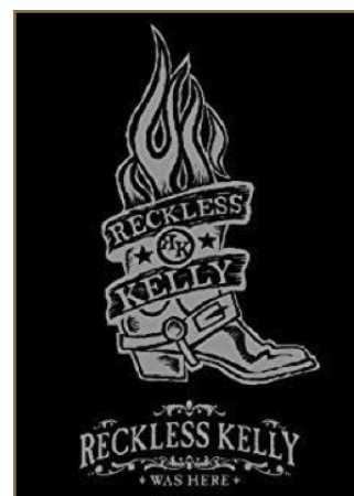
Reckless Kelly's latest tour logo