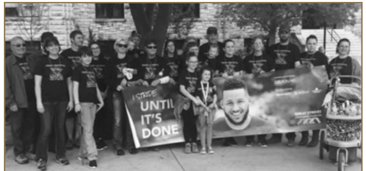
Alpha Zeta members volunteered once again at the 2019 Great Strides Walk to end Cystic Fibrosis